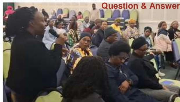
Question &amp; Answer

Did you know that being a Minister does not exempt you from hidden curses that you have not been delivered from (1 Kings 2:26 & 27) ? and a minister over a flock is a target of the enemy? (Zechariah 13:7). We learnt at the retreat, of the need to be mindful of the existence and power of curses, and deal with them so that they do not work against us.